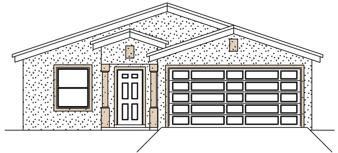
FRONT ELEVATION "B"