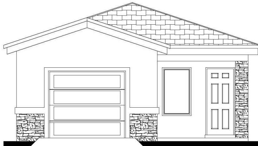
FRONT ELEVATION - B